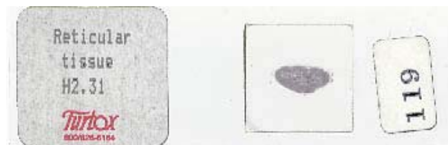
Lymph node silver stained to show connective tissue reticular fibers (black).

Identify reticular fiber distribution in: capsule, trabeculae, subcapsular sinuses, intermediate sinuses, lymphoid nodules, the inner cortex, and the medulla.