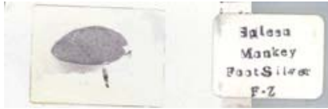
(monkey silver stain)

Spleen silver-stained to show connective tissue reticular fibers (black), compare this with the silver-stained lymph node.