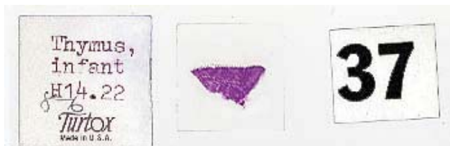
Section of a thymus lobe of an infant.

The thymus changes its histological appearance from infant to puberty to adult, in a process called involution (replacement of cortical lymphoid tissue by adipose tissue) and there is also an increase in the size of thymic corpuscles.